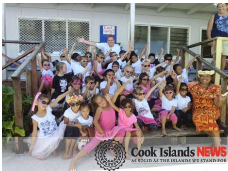
Classroom of children at Te Uki Ou primary school where Ake attends