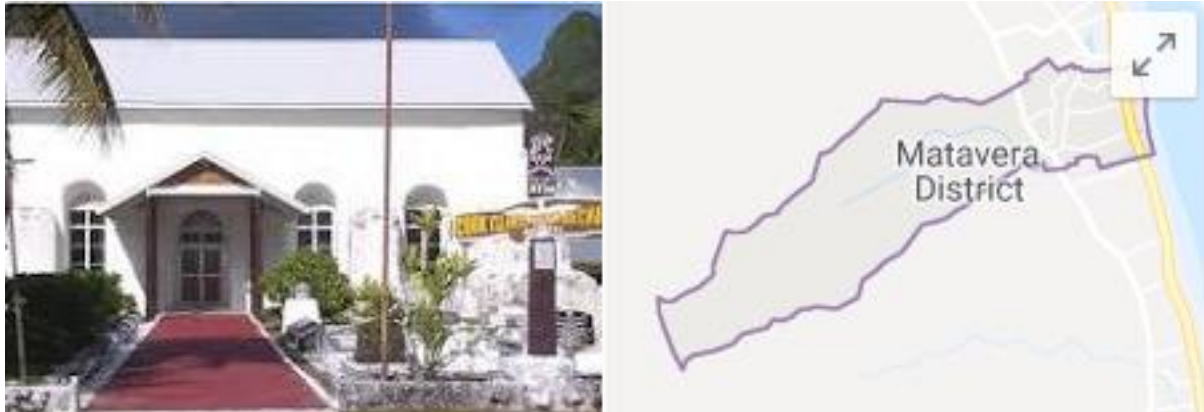
Matavera CICC Church, Location of one of the three water stations in Matavera – A central hub of the village.

The Matavera Water Station was opened on 9 Sept 2015 by the Hon. Kiriau Turepu, Member of Parliament for the village of Matavera, with the generous support of the Cook Foundation. The water station provides filtered, ultraviolet (UV) treated water safe for Matavera Village community to drink.