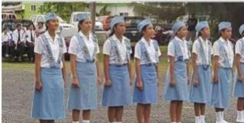
Cook Islands Girls Brigade

The Mitiaro girls' brigade Company have a number of young female members who are also unemployed mothers and young leaders within the organization. The young women significantly contribute and participate in all Mitiaro island initiatives and activities.