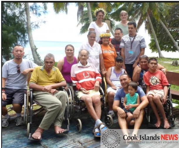
A few Creative Centre Members on an outing

The Creative Centre was founded in 2002 and is a day centre that provides care and activities for people with special needs over the age of 16. The centre aims to find pathways to as much independence as possible for people with special needs, and includes activities, lessons about various crafts and visits to events and community. The centre is necessary service, providing a positive and happy place for Cook Islanders with special needs, and is not possible without the support of sponsors, fundraising activities, and donor funding. The centre opens 48 weeks of the year and closes of the Christmas and New Year period.