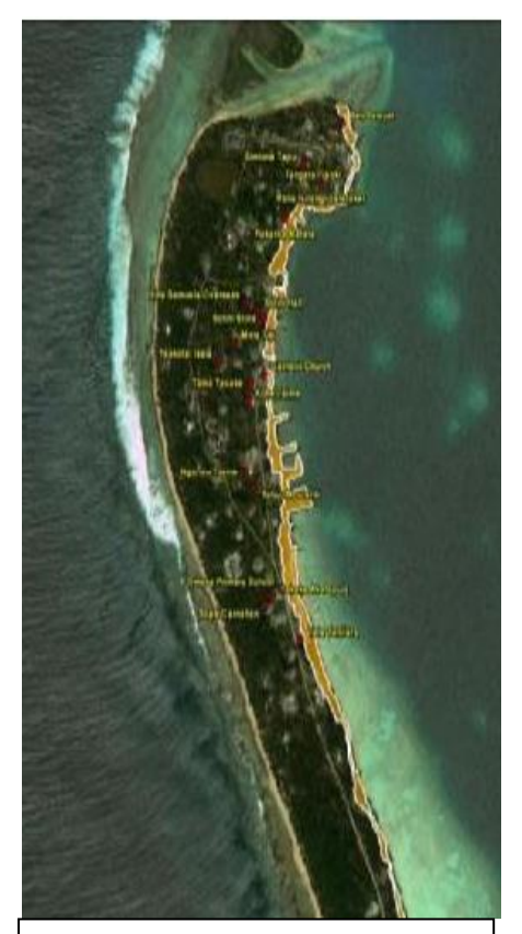
The village of Omoka located on a narrow low lying strip of land.